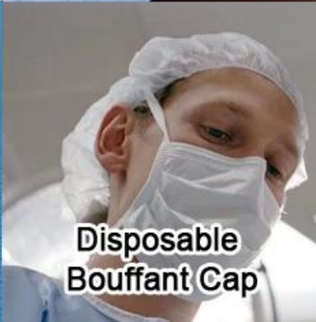
Disposable Bouffant Cap