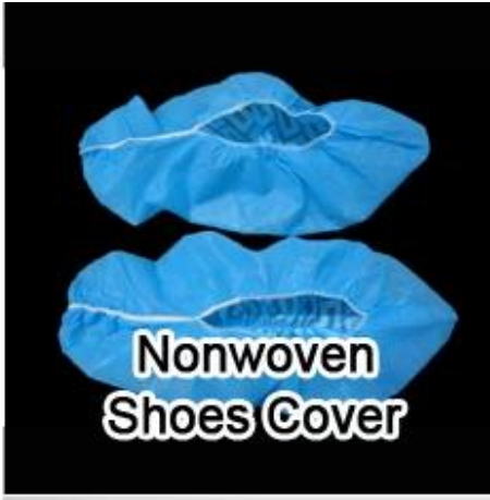
Nonwoven Shoes Cover