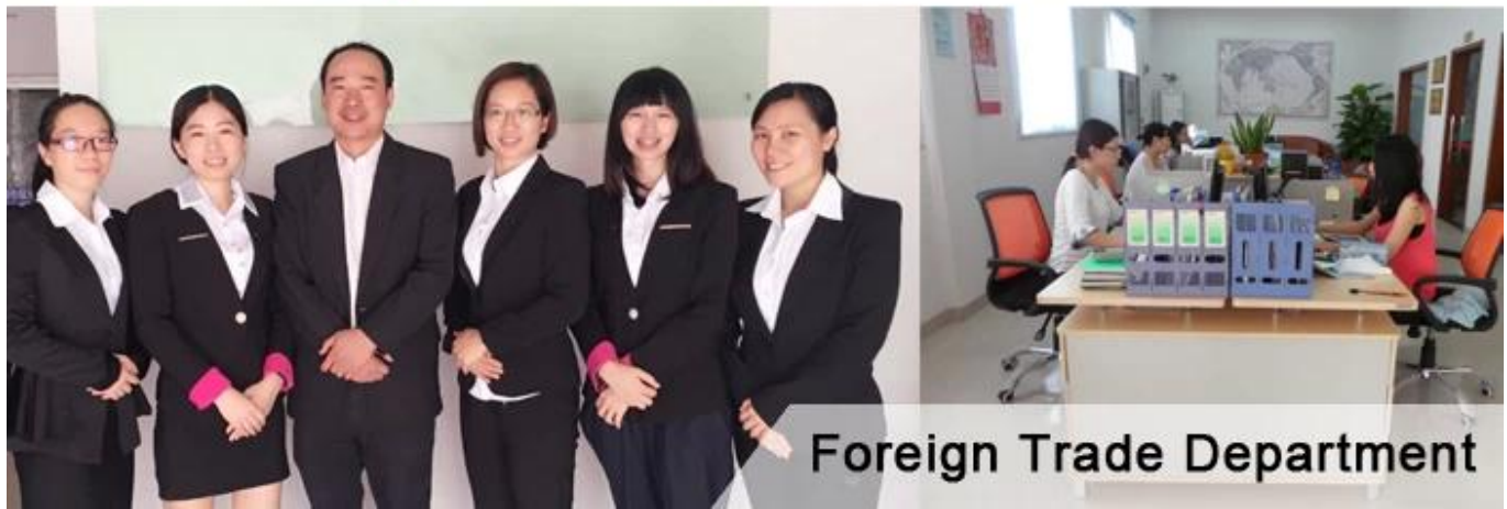
Foreign Trade Department