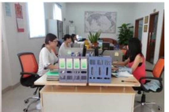
Foreign Trade Department