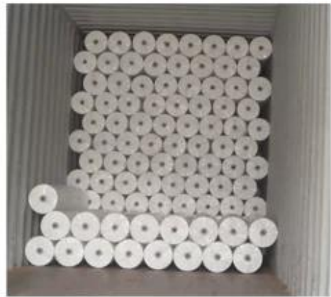
loaded in container