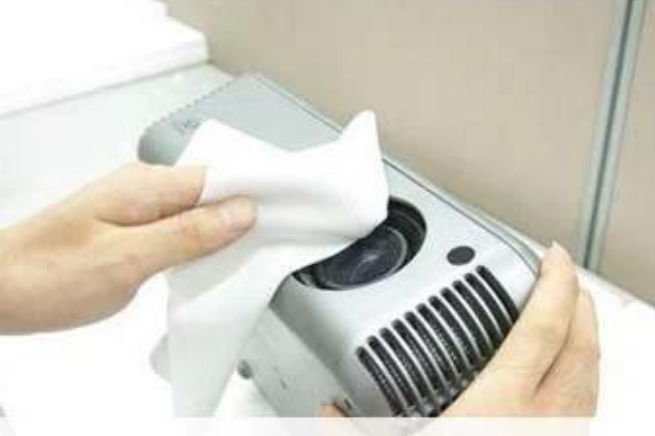
spunlace nonwoven fabric for electronics