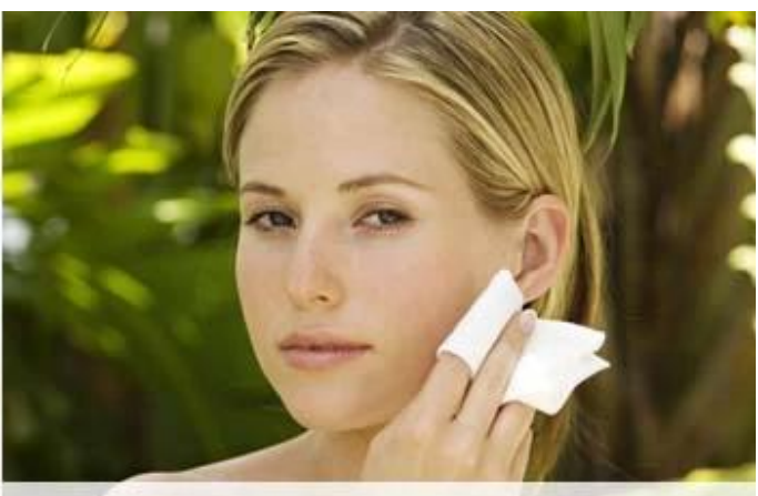
spunlace nonwoven fabric for make-up