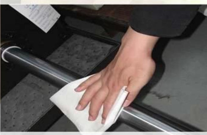
spunlace nonwoven fabric for industrial wiping