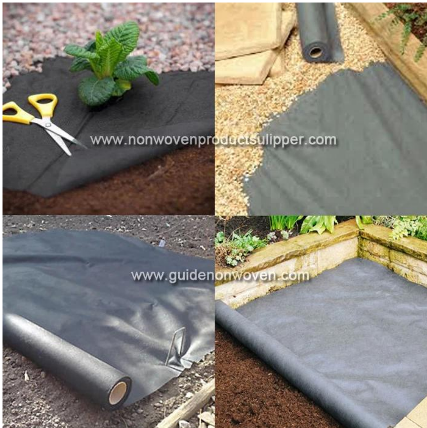
Product Packaging and Shipping of ZQ-A PP Spunbond Non woven Agricultural Mulching Film Weed Control Fabric