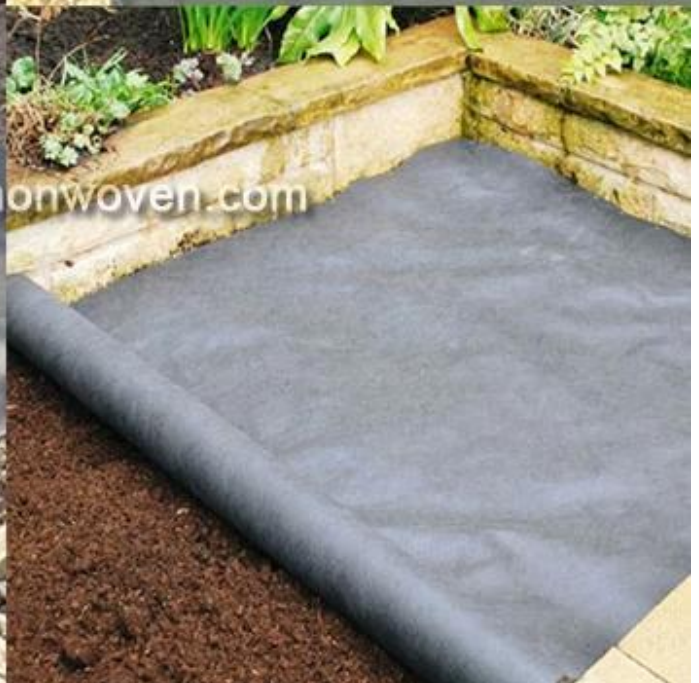
Product Packaging and Shipping of ZQ-A PP Spunbond Non woven Agricultural Mulching Film Weed Control Fabric