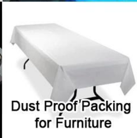
Dust Proof Packing for Furniture

Product Packaging and Shipping of Wholesale Heart-shaped Embossing GT-LSHSLPI01 PP Spunbonded Non Woven Flower Packaging For Valentine's Day