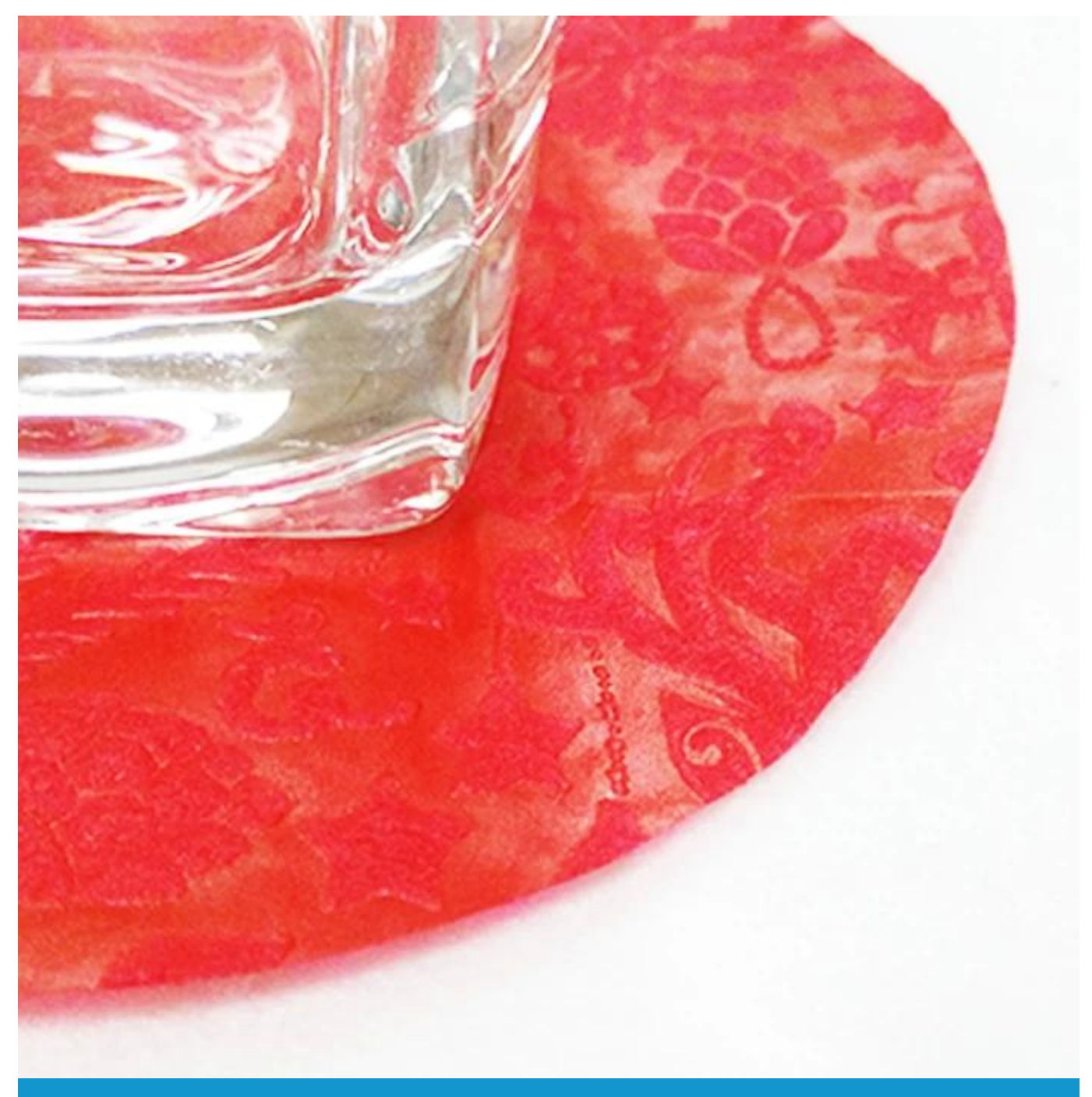
Product Packaging and Shipping of Wholesale Beer Coaster