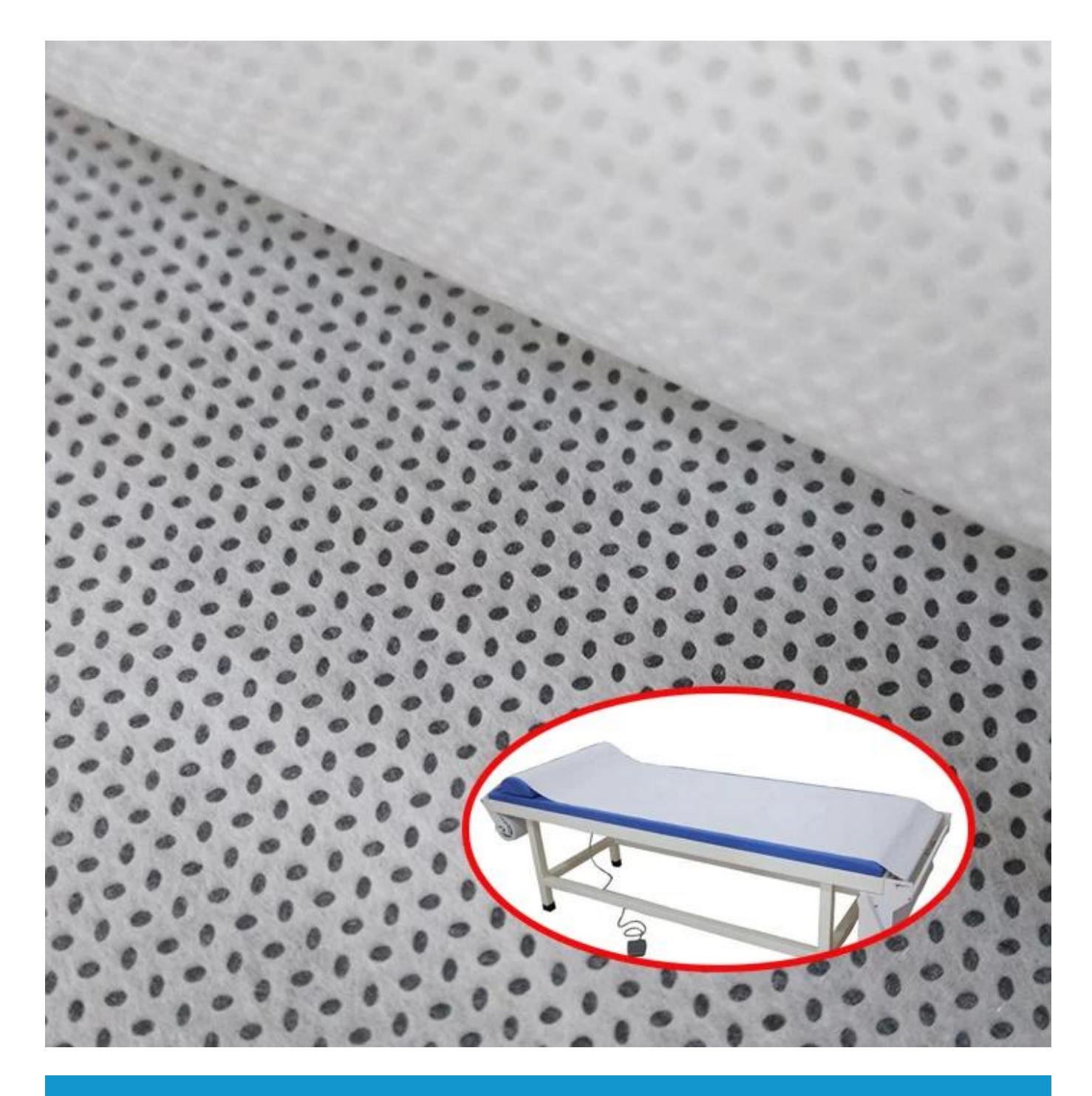
Applications of Waterproof Disposable Bedspread