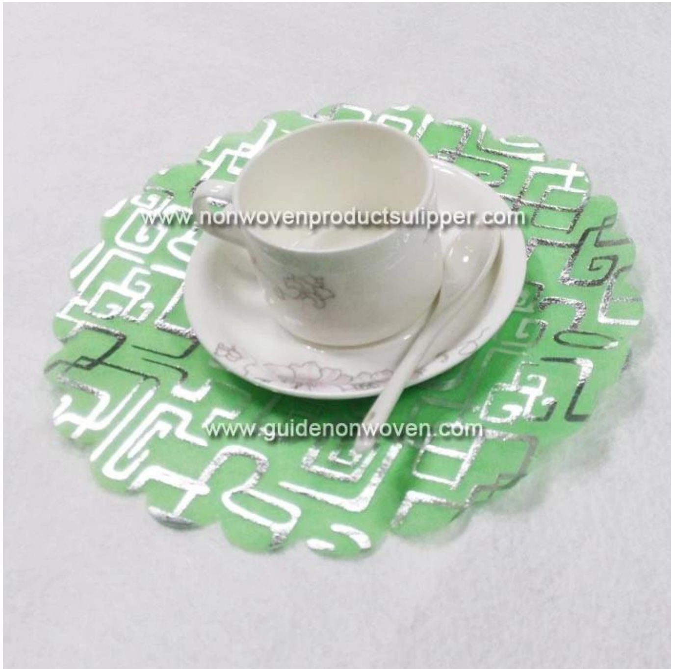
Product Packaging and Shipping of TN51-30-040-015 Lace Cut Silver Printed Decorative Non Woven Fabric Tableware Mat