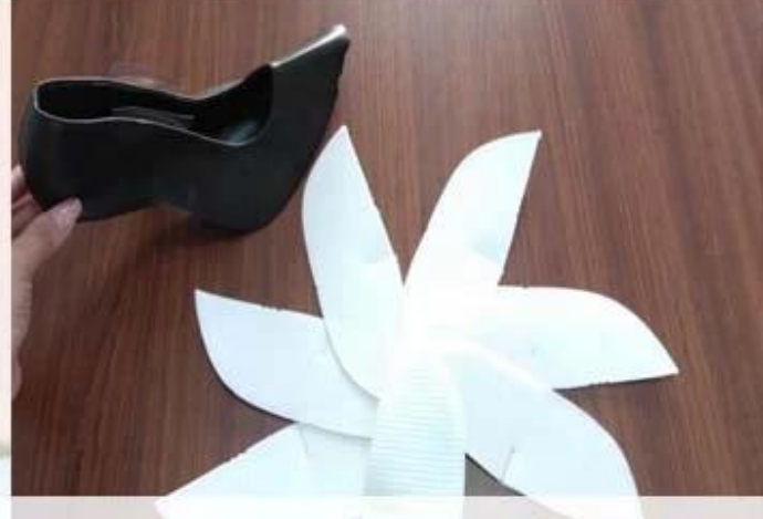
spunlace nonwoven fabric for shoe material

Product Packaging & Shipping of Spunlace Nonwoven Fabric Custom Microfiber Anti Bacterial Non woven Fabric