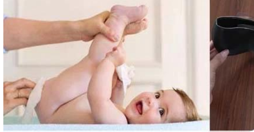
spunlace nonwoven fabric for wet tissue