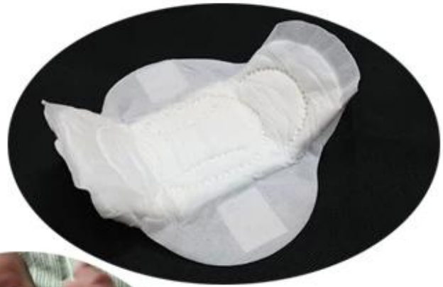
pp spunbond perforated non woven fabric