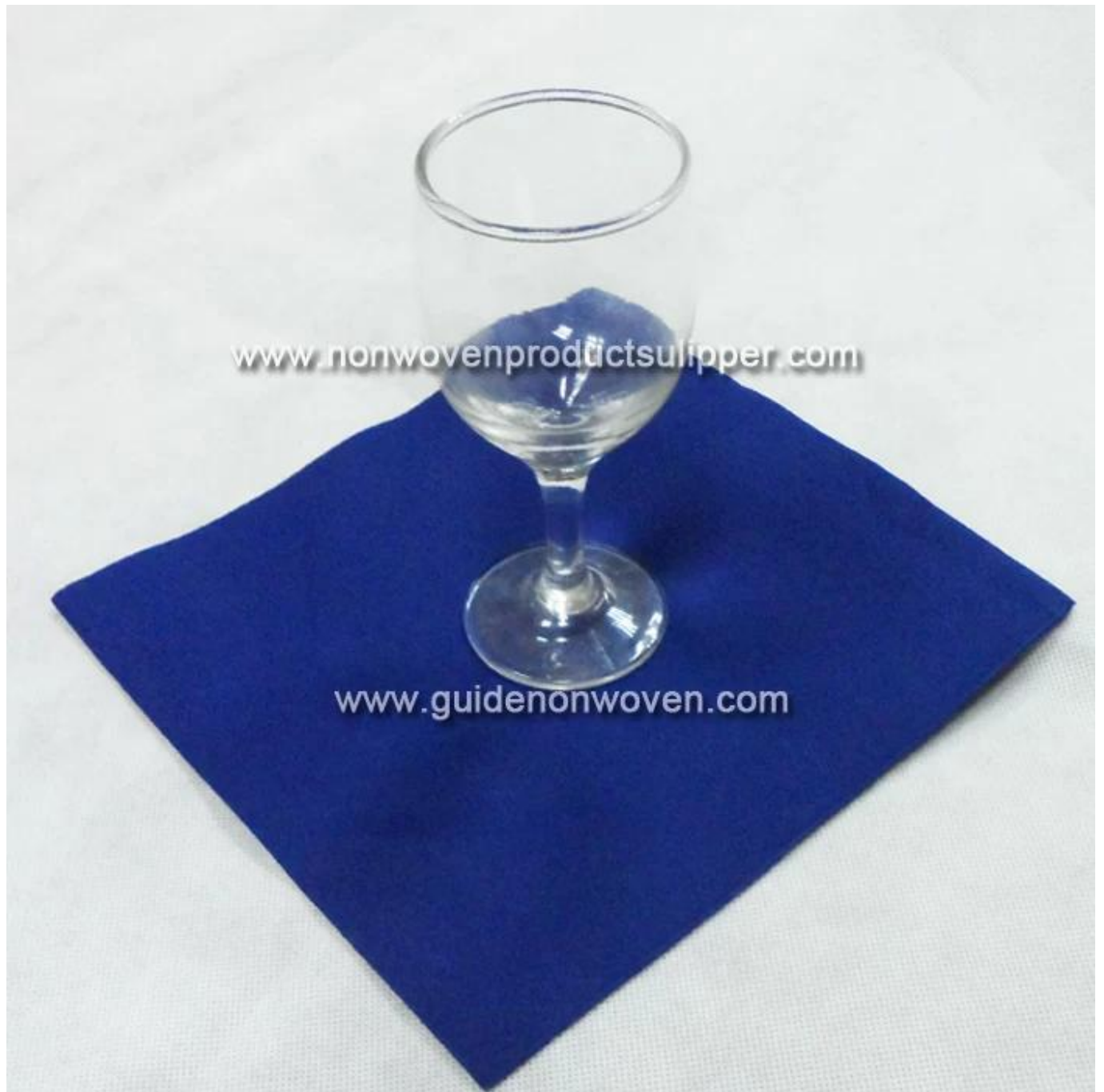
Product Packaging and Shipping of Sapphire Blue Color 24x24cm 1/4 Folding Banquet Airlaid Cocktail Napkin