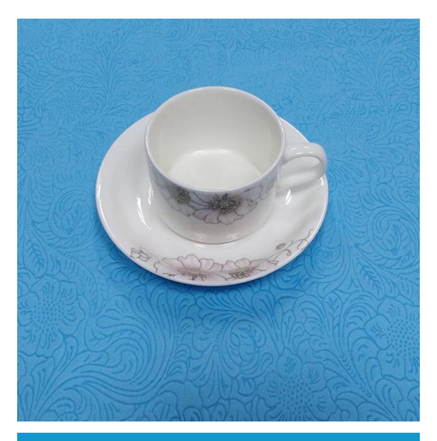
Applications of PP Spun Bonded Non Woven Fabric For Shopping Bag