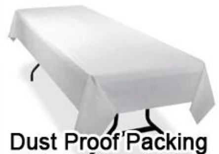
Dust Proof Packing for Furniture

Product Packaging and Shipping of Polyester Non-woven Flower Packing Material