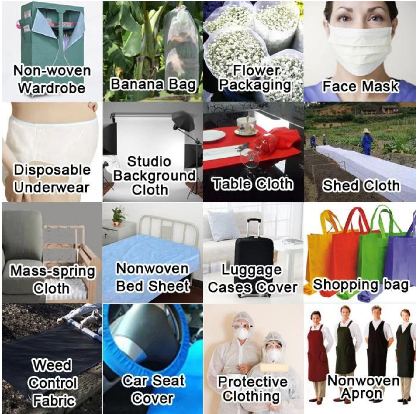
Product Packaging and Shipping of Non Woven Fabric