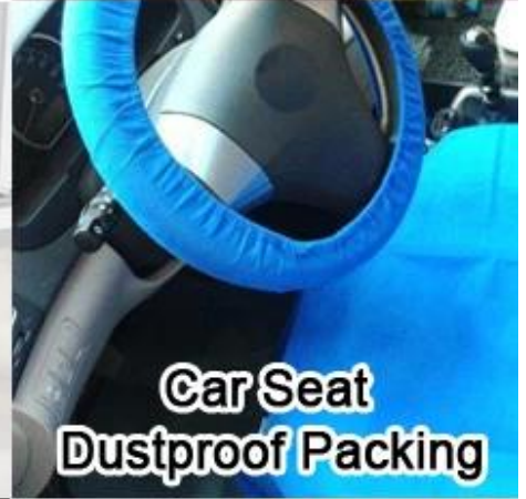
Car Seat Dustproof Packing