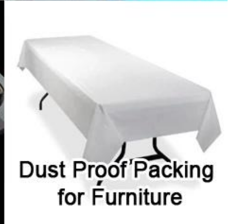
Dust Proof Packing for Furniture