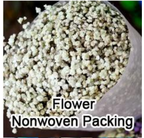
Flower Nonwoven Packing