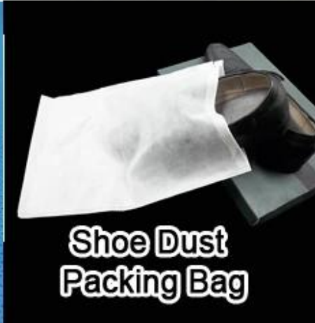
Shoe Dust Packing Bag