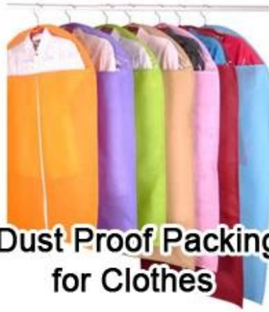
Dust Proof Packing for Clothes