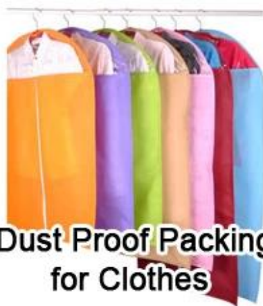
Dust Proof Packing for Clothes