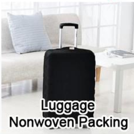
Luggage Nonwoven Packing