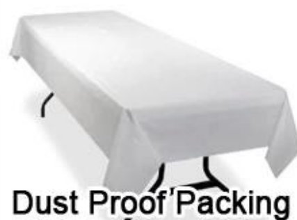
Dust Proof Packing for Furniture

Product Packaging of Nonwoven Materials For Flower Wrapping Non-Woven Paper China Nonwoven Flower Wrapping