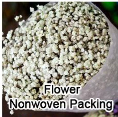
Flower Nonwoven Packing