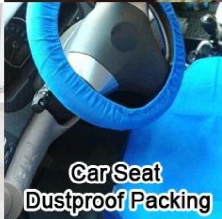
Car Seat Dustproof Packing