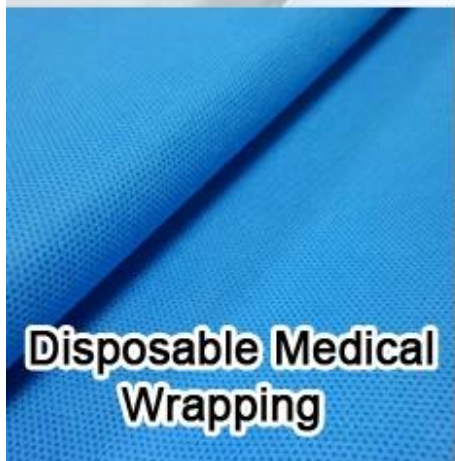
Disposable Medical Wrapping