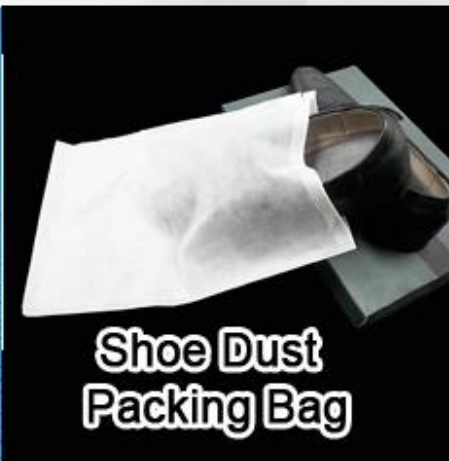
Shoe Dust Packing Bag