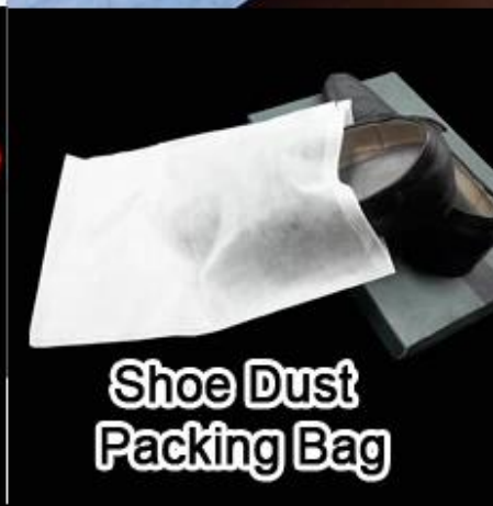
Shoe Dust Packing Bag