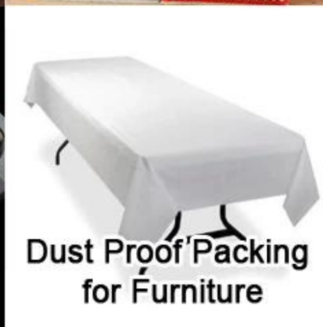
Dust Proof Packing for Furniture

Product Packaging and Shipping of Flower Printing Polyester Spunbond Non Woven Fabric For Decoration JL-3092