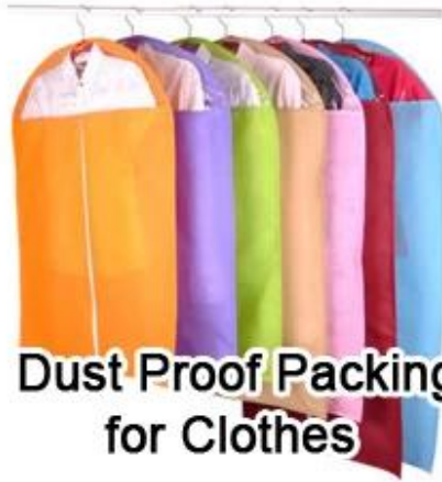
Dust Proof Packing for Clothes