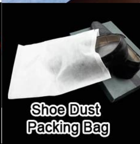
Shoe Dust Packing Bag