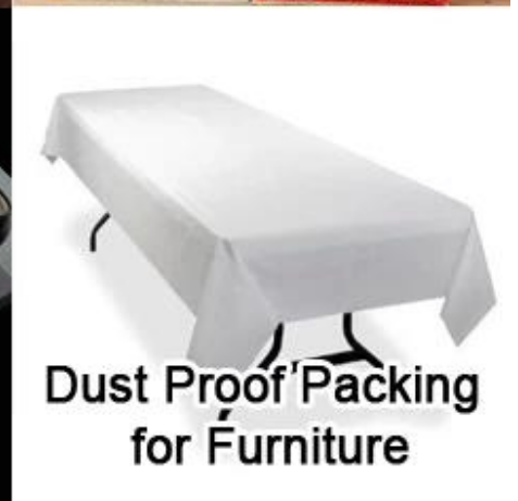
Dust Proof Packing for Furniture

Product Packaging and Shipping of Flower Printing Polyester Spunbond Non Woven Fabric For Decoration JL-3092