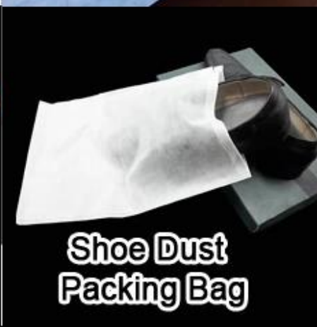
Shoe Dust Packing Bag