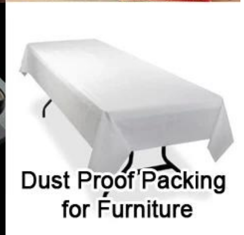
Dust Proof Packing for Furniture

Product Packaging and Shipping of Heart Shape Printing Polyester Spunbond Non Woven Fabric For Packaging JL-2025