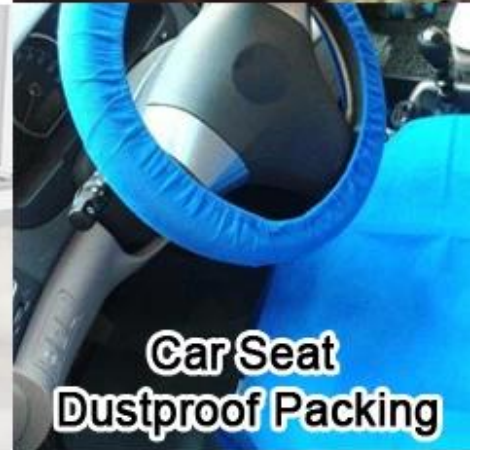
Car Seat Dustproof Packing