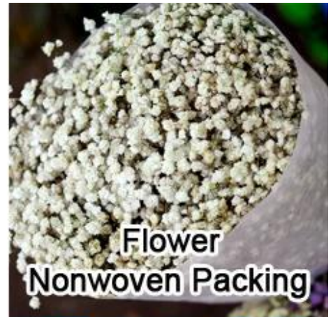
Flower Nonwoven Packing