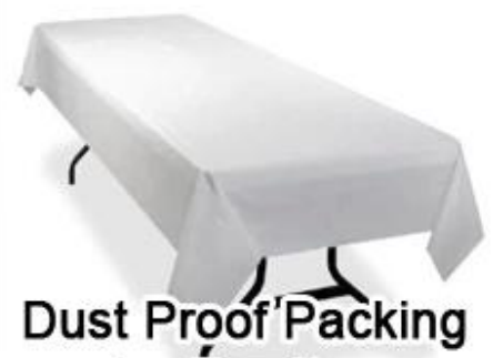
Dust Proof Packing for Furniture

Product Packaging and Shipping of Gift Flower Wrapping Packaging Paper Nonwoven Linen Fabric