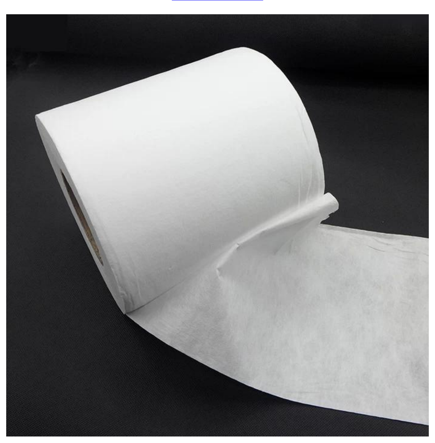
Mask Fabric On Sales