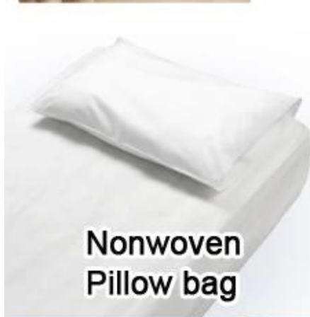
Nonwoven Pillow bag