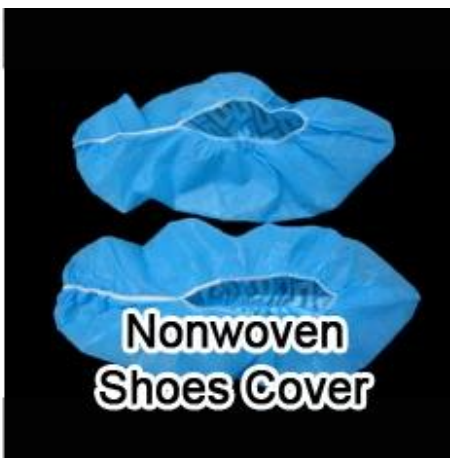
Nonwoven Shoes Cover