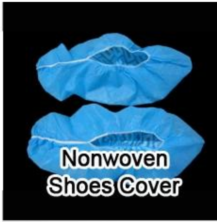
Nonwoven Shoes Cover