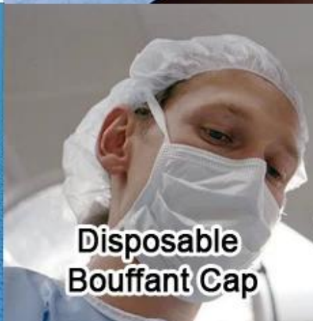
Disposable Bouffant Cap