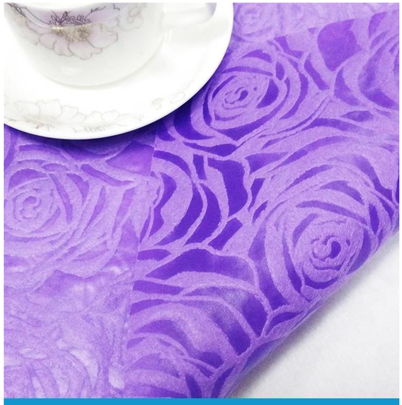
Product Packaging and Shipping of Hotel Table Covers