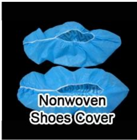
Nonwoven Shoes Cover