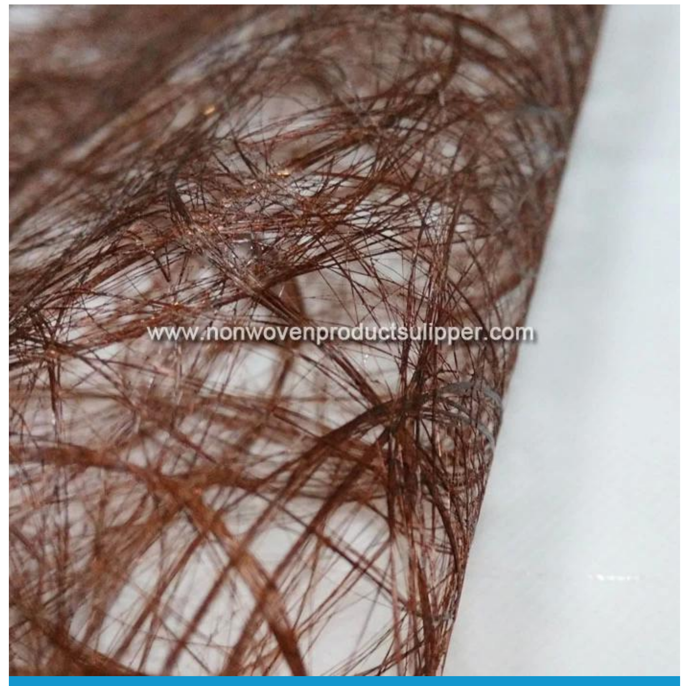
Product Packaging and Shipping of GTDL1001-E Brown Color Floss Non Woven Fabric Wholesale Non Woven Roll For Wall Decoration