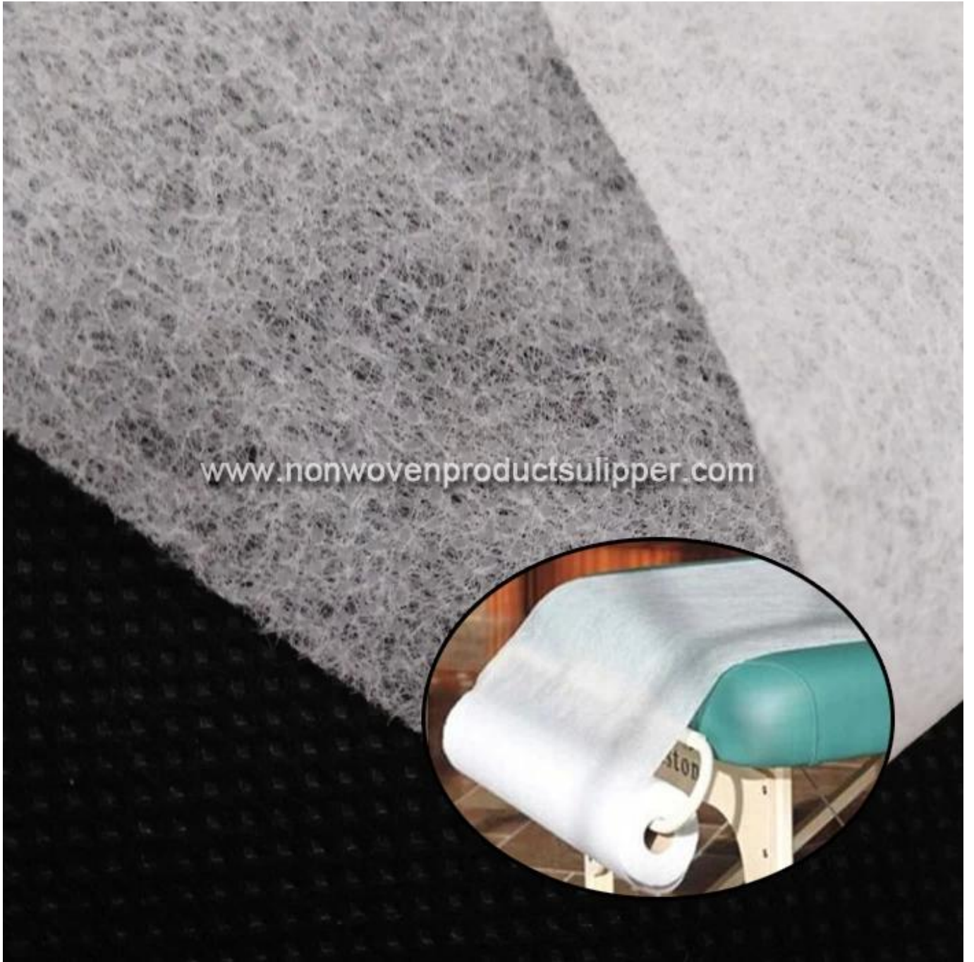
Product Packaging and Shipping of GT-YZHL-01B Non Woven Disposable Medical Bedsheet For Hospital