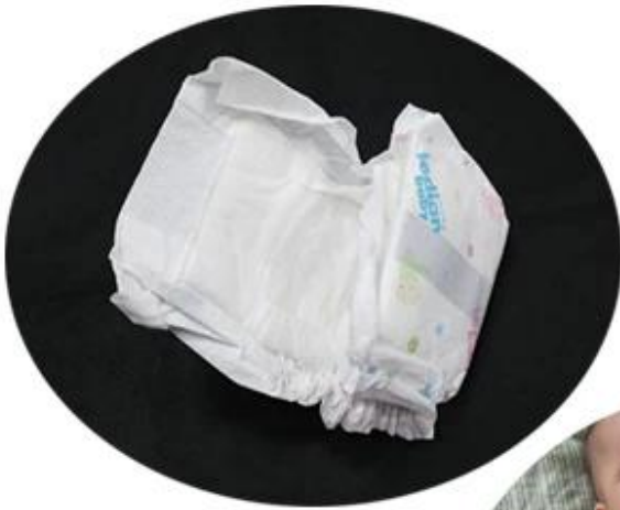
pp hot air through non woven fabric