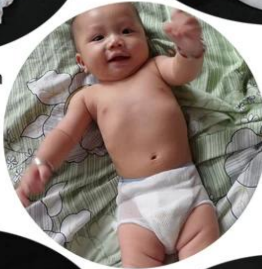
pp spunbond perforated non woven fabric