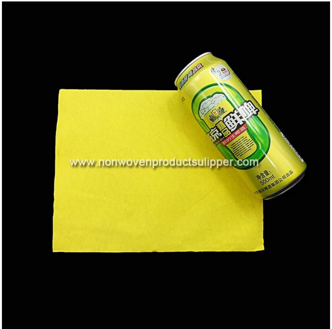
Product Packaging and Shipping of GT-LY01 5 Star Hotel And Restaurant Plain Air-laid Non Woven Table Decoration Placemat For Sale