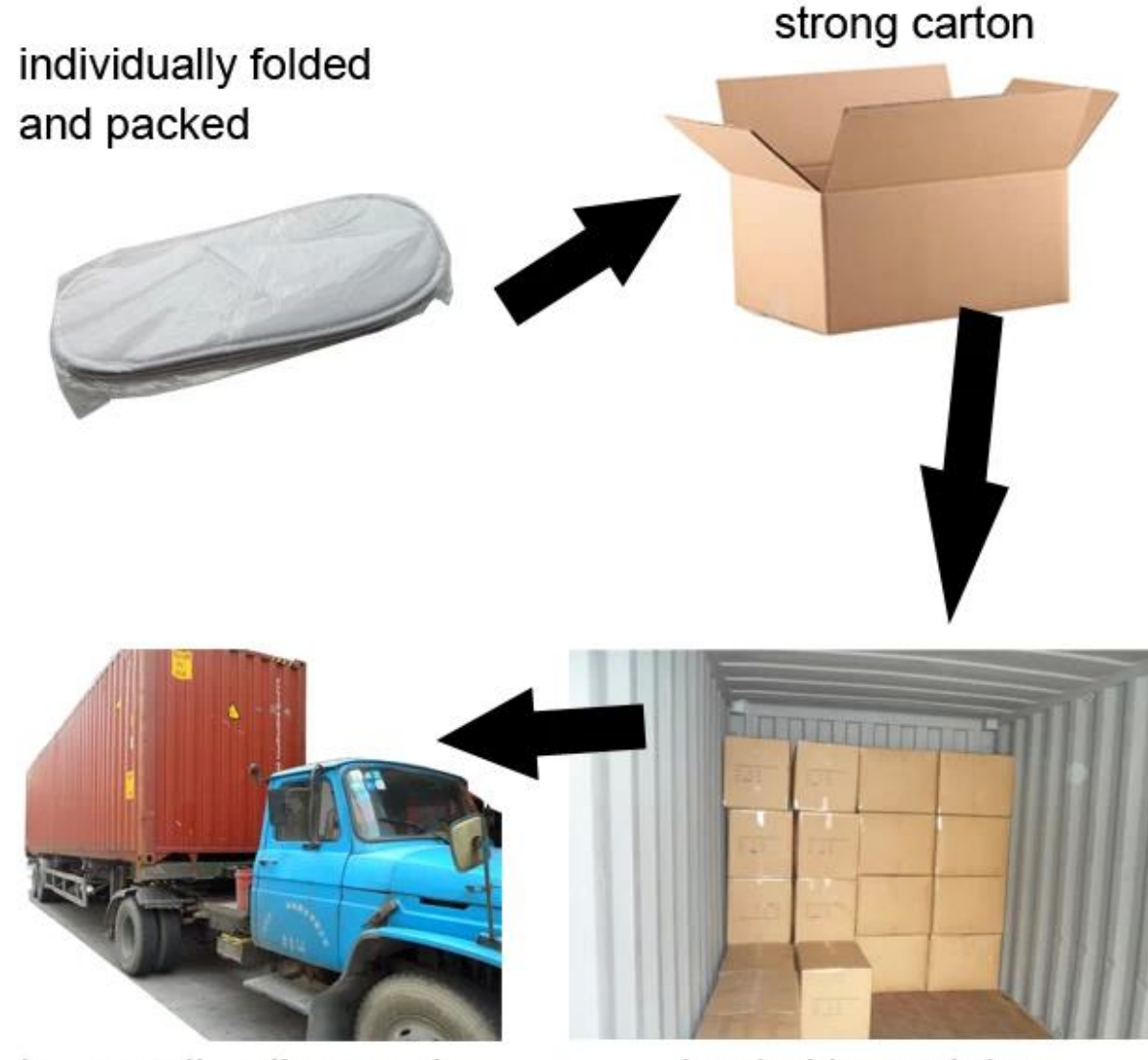
transporting the goods to the port