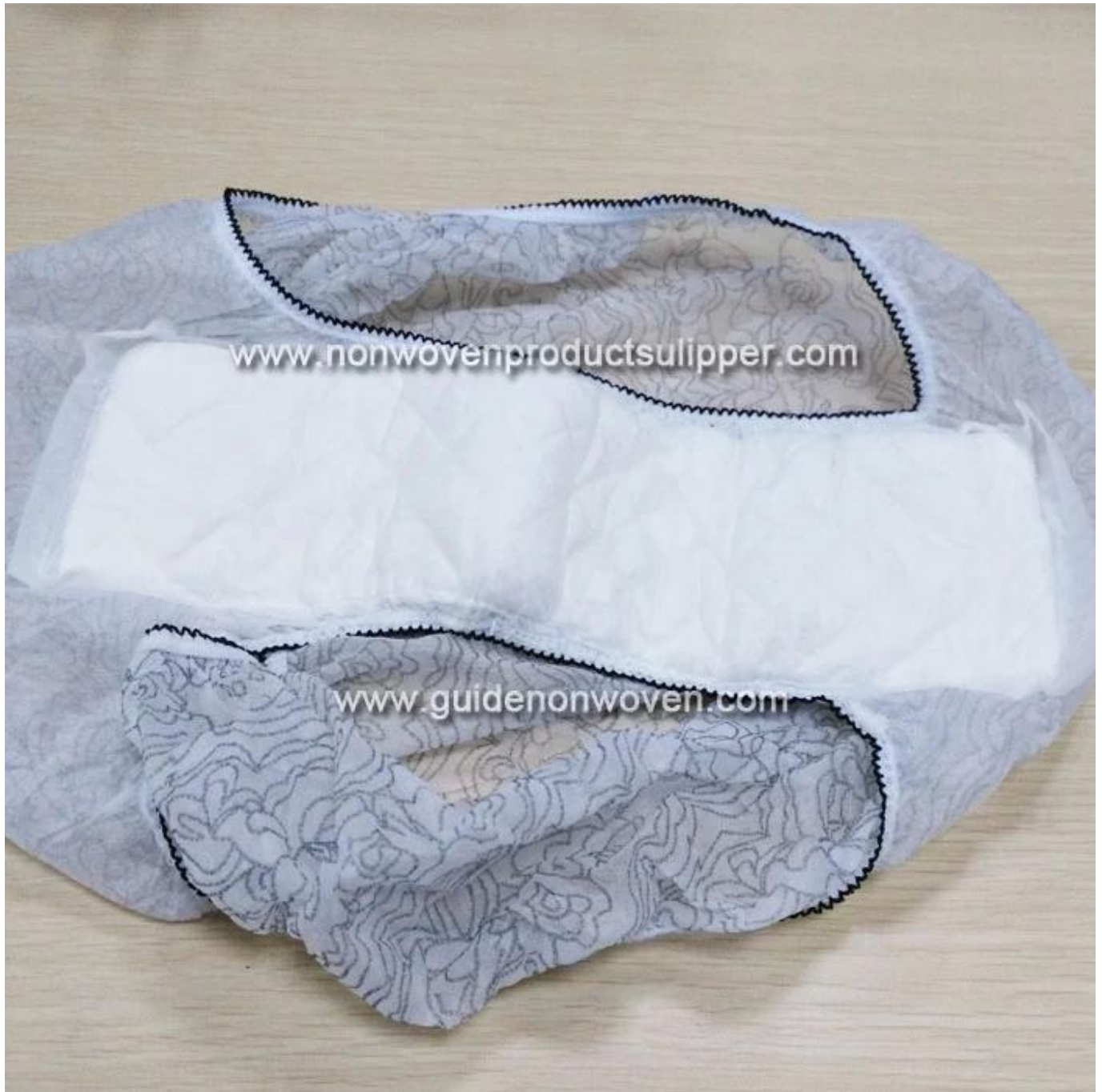
Product Packaging and Shipping of Female Maternity Disposable Non Woven Panty With Sanitary Napkin ZK01