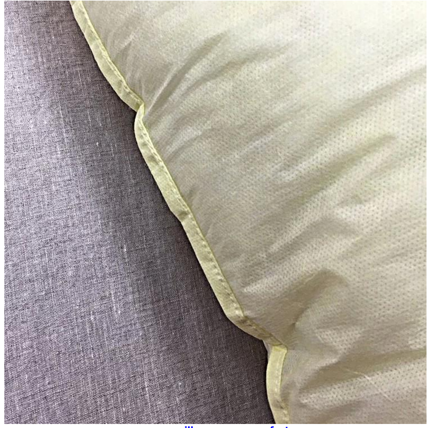
non woven pillow cover manufacturer

Product Packaging & Shipping of Disposable Non Woven Pillow Cover For Hotel Hospital Spa Non Woven Pillow Cover