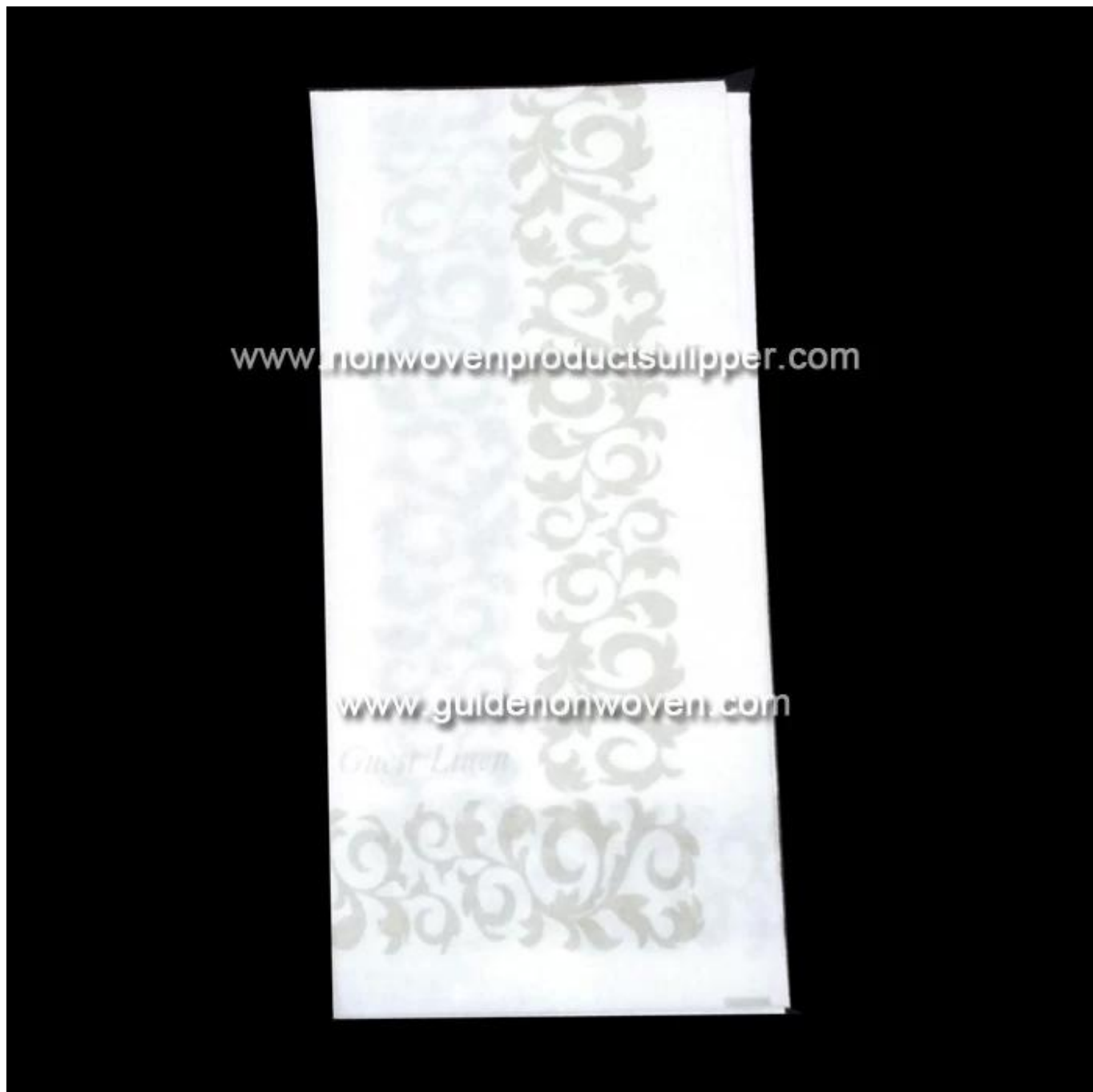
Product Packaging and Shipping of DA - Gold Full Printing 1/6 Fold 11.5 x 17 cm Feel Like Linen Dinner Napkin