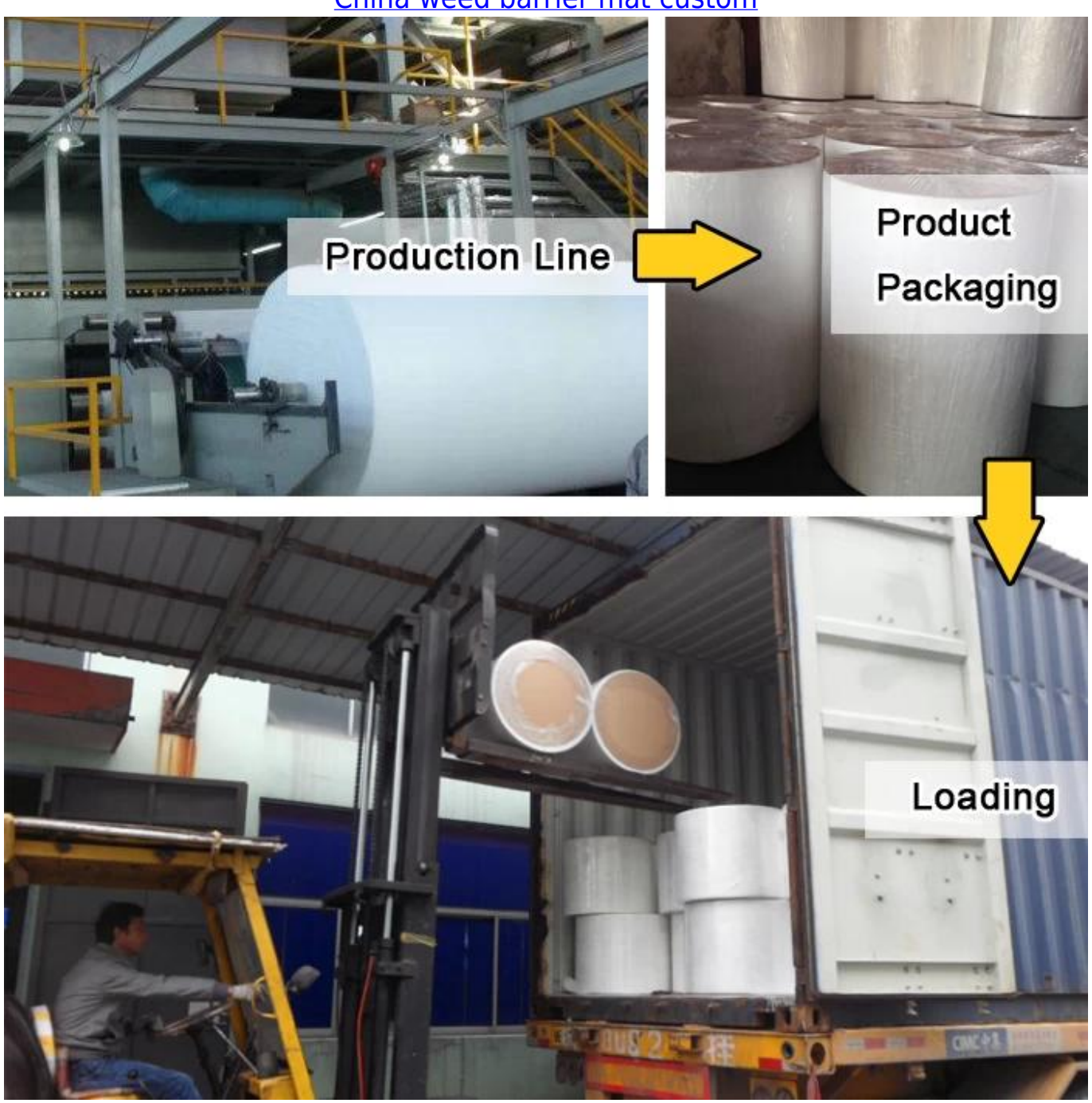
China weed barrier mat custom