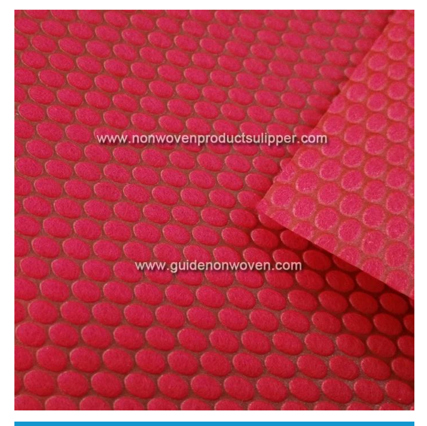
Product Packaging and Shipping of Claret Color PP Spun-bond Non Woven Fabric For Festival Decoration