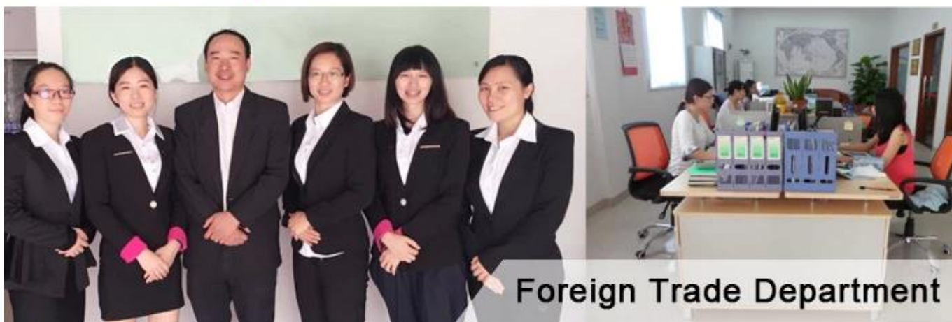
Foreign Trade Department