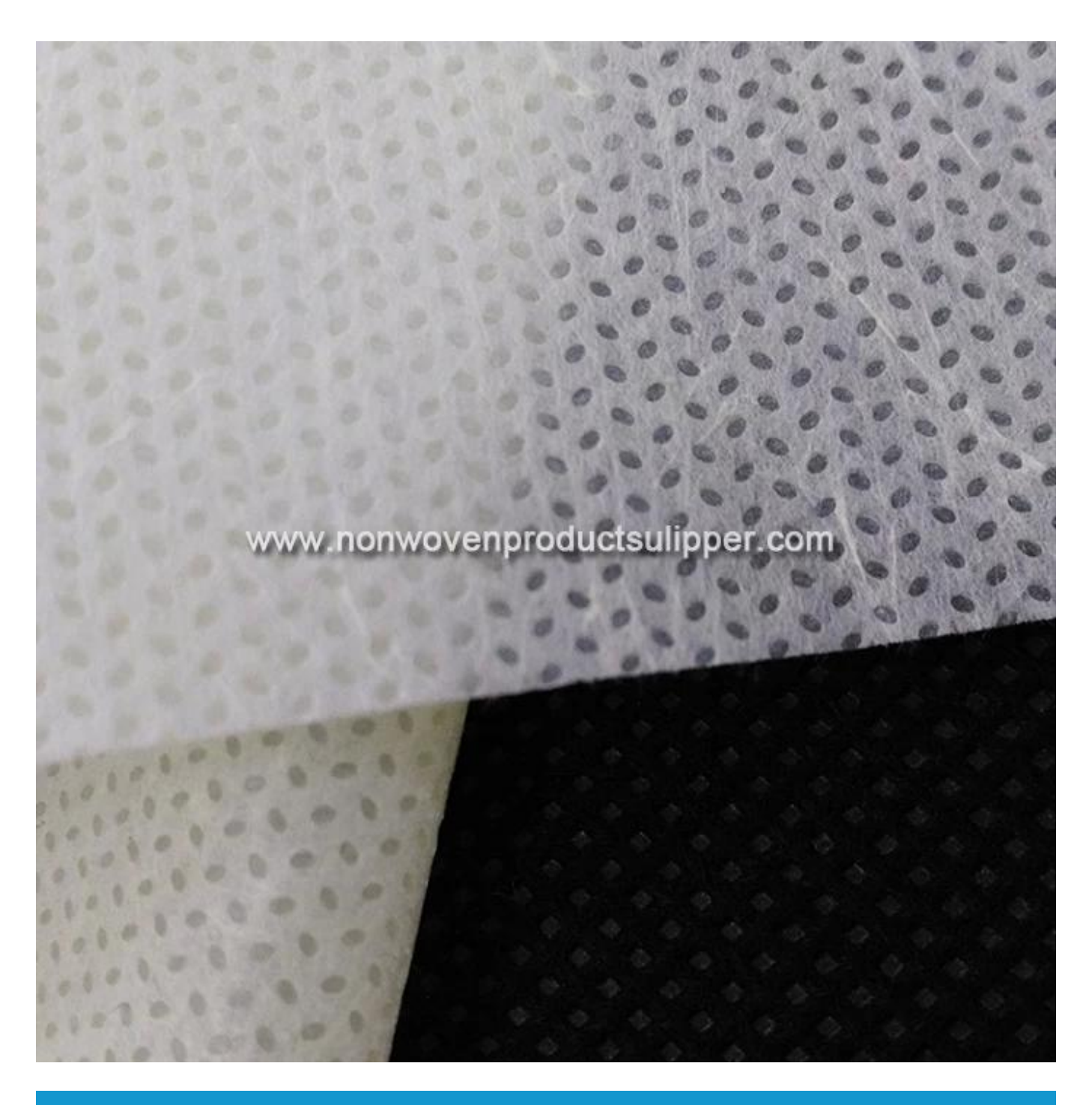
Applications of China LY2# 25 gsm SMS Non Woven Medical Materials On Sales