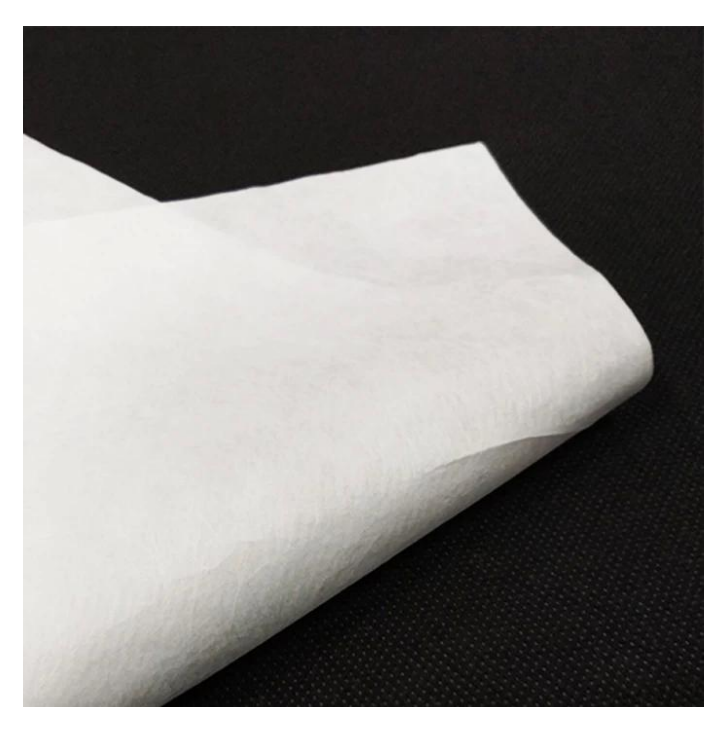
Materials For Face Mask Supplier

Product Packaging and Shipping of BFE95 Meltblown Non Woven Fabric For Face Mask