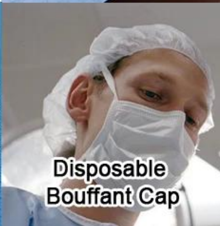
Disposable Bouffant Cap