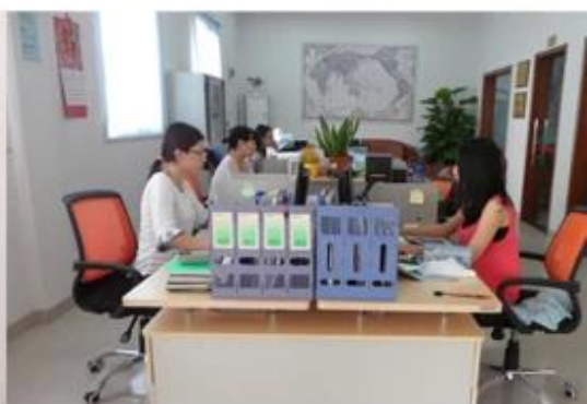
Foreign Trade Department