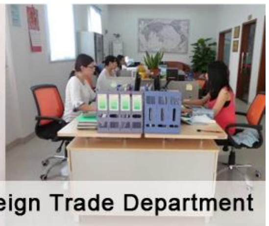
Foreign Trade Department