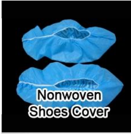
Nonwoven Shoes Cover