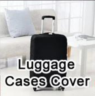
Luggage Cases Cover