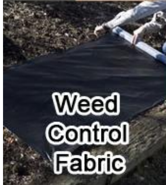
Weed Control Fabric