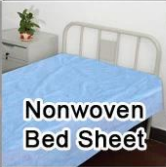
Nonwoven Bed Sheet