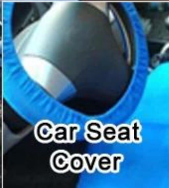
Car Seat Cover