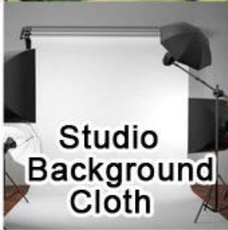
Studio Background Cloth