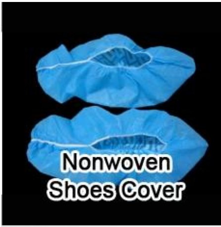
Nonwoven Shoes Cover