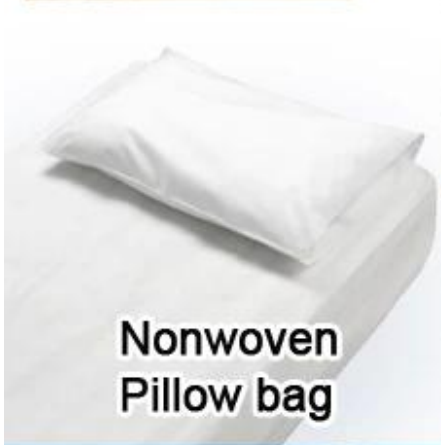
Nonwoven Pillow bag