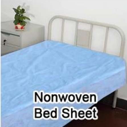
Nonwoven Bed Sheet