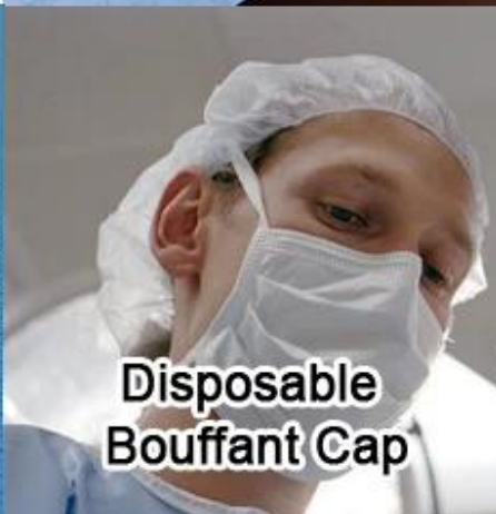
Disposable Bouffant Cap