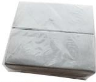
50/100 pcs per pack, individually packed per bag