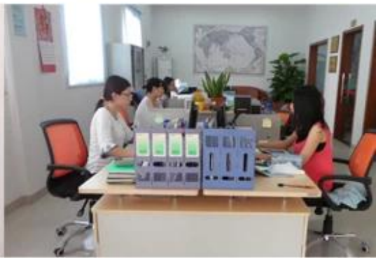
Foreign Trade Department