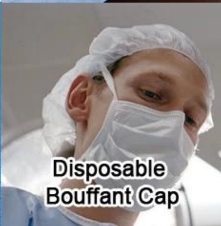
Disposable Bouffant Cap