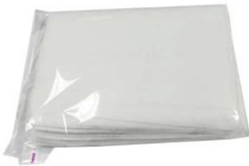
30pieces/bag, or custom-order