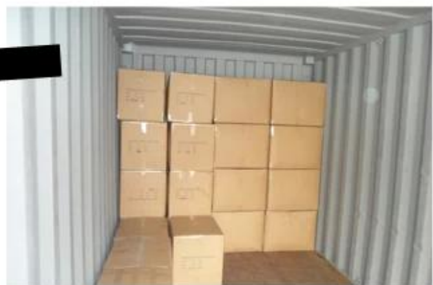
loaded in container

FAQ of Composite Blue Waterproof Disposable Table Cloths