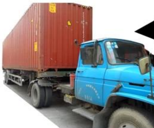
transporting the goods to the port