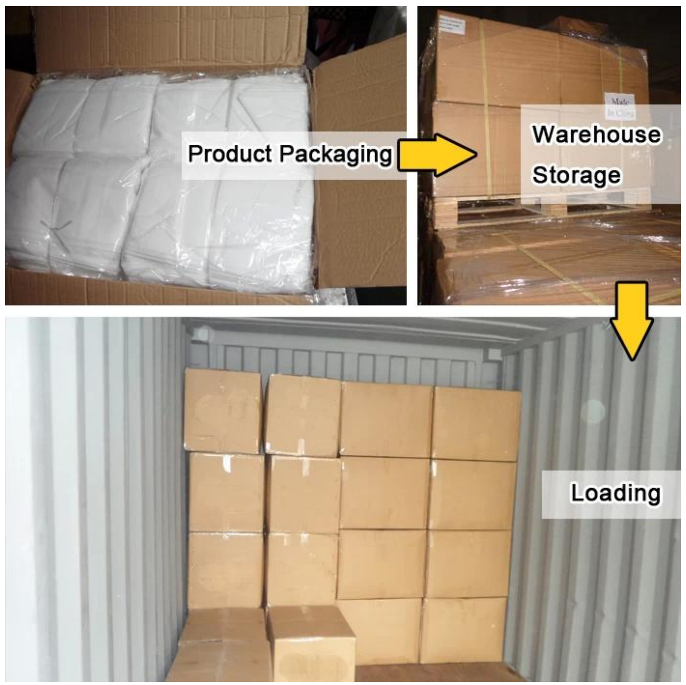
Shoe Bags Manufacture