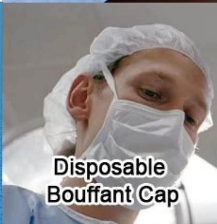
Disposable Bouffant Cap